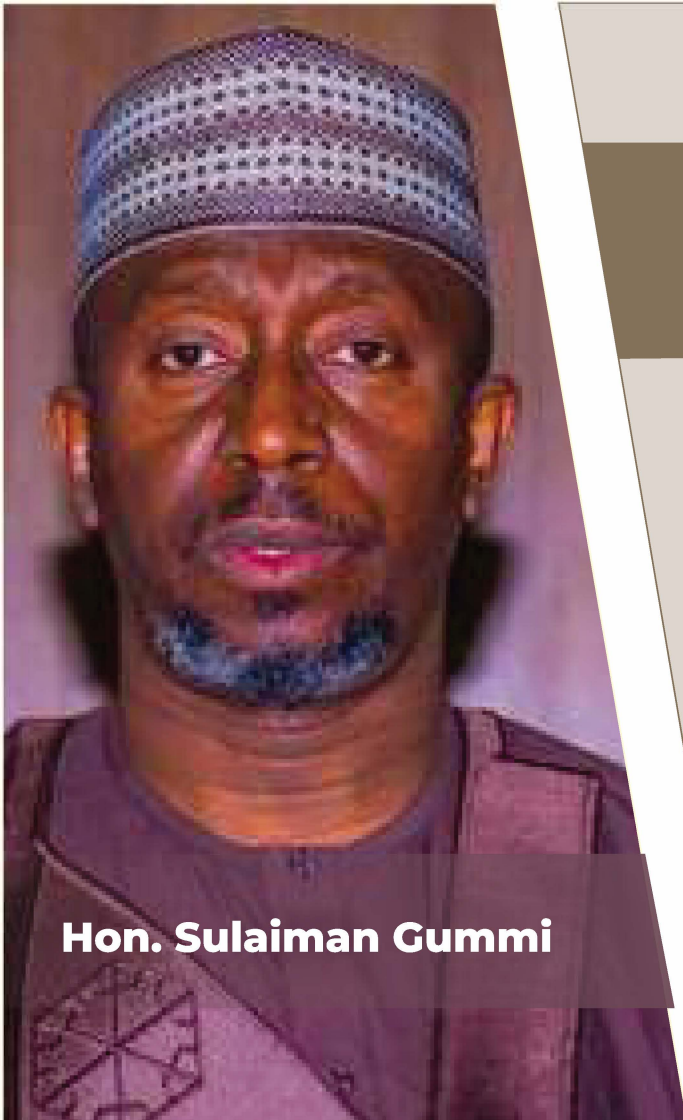
Hon. Sulaiman Gummi