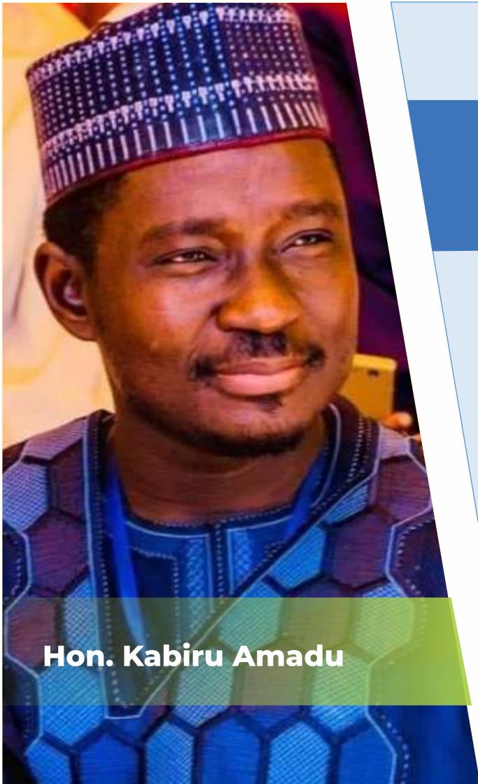
Hon. Kabiru Amadu