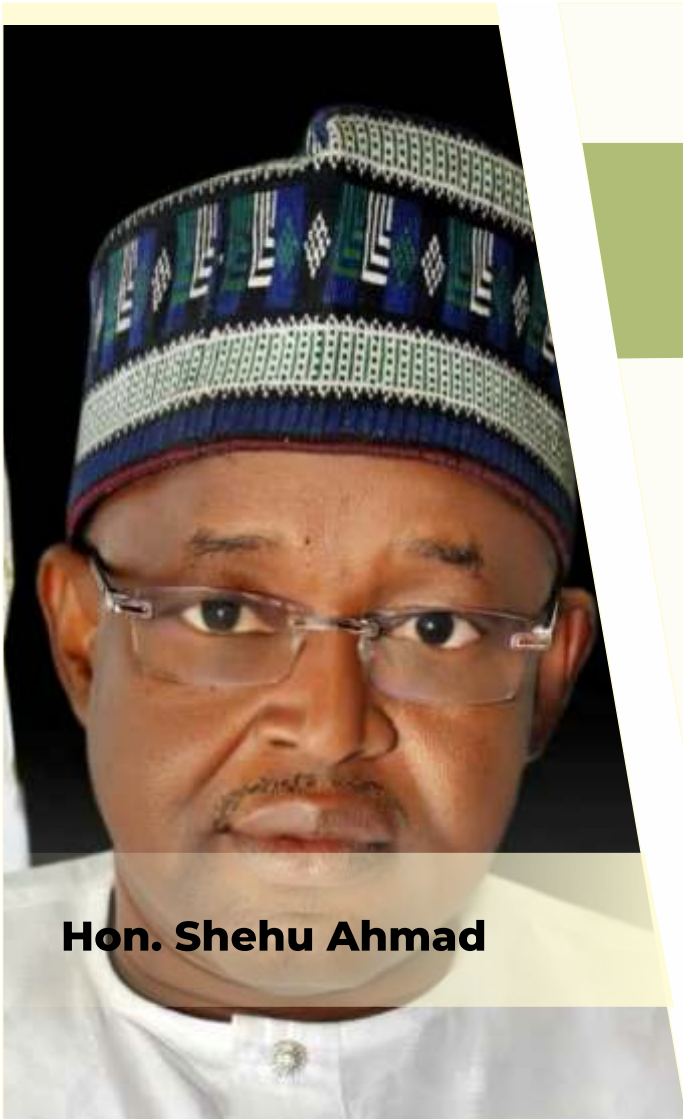
Hon. Shehu Ahmad