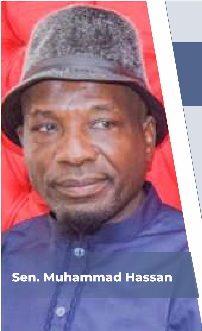
Sen. Muhammad Hassan