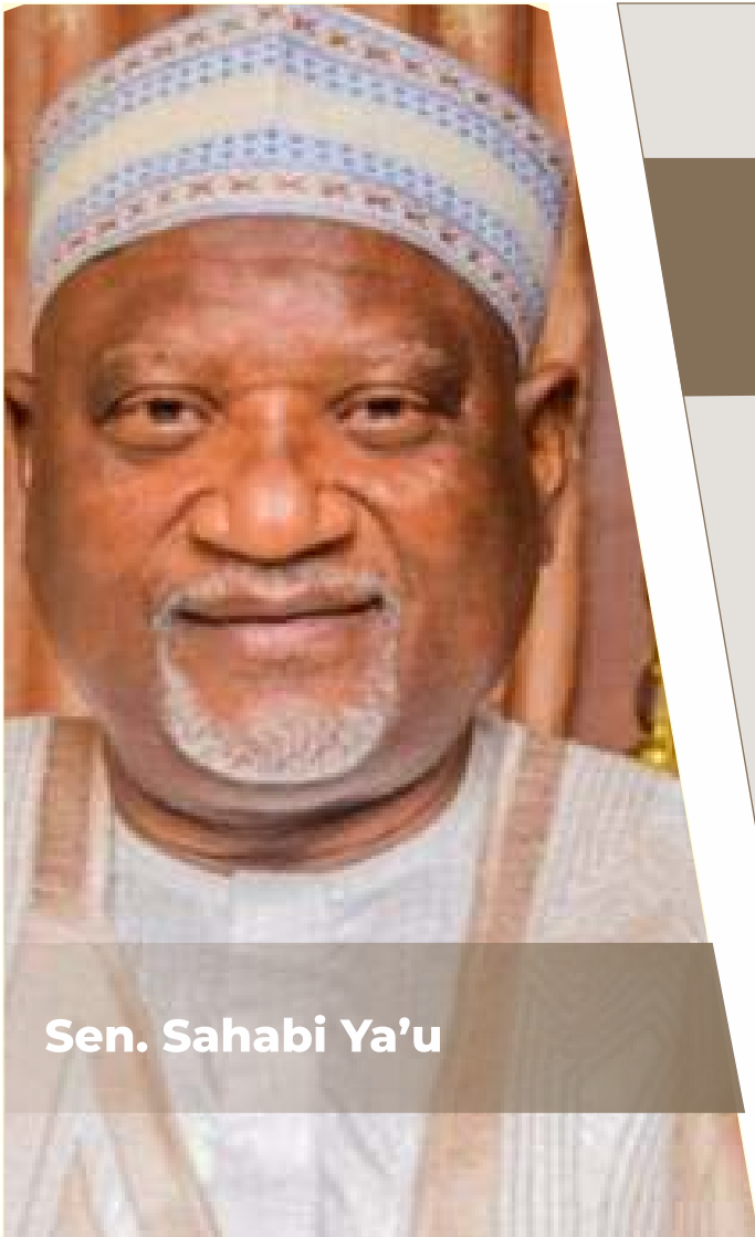
Sen. Sahabi Ya'u