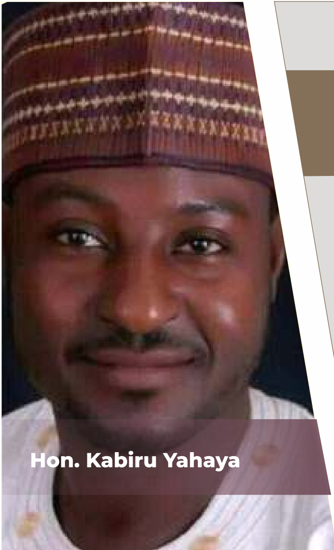
Hon. Kabiru Yahaya