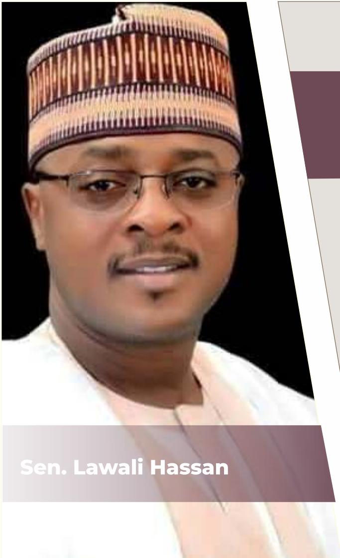
Sen. Lawali Hassan