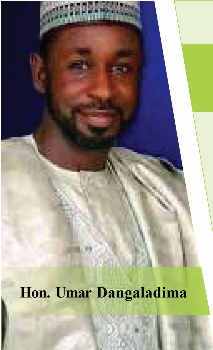
Hon. Umar Dangaladima