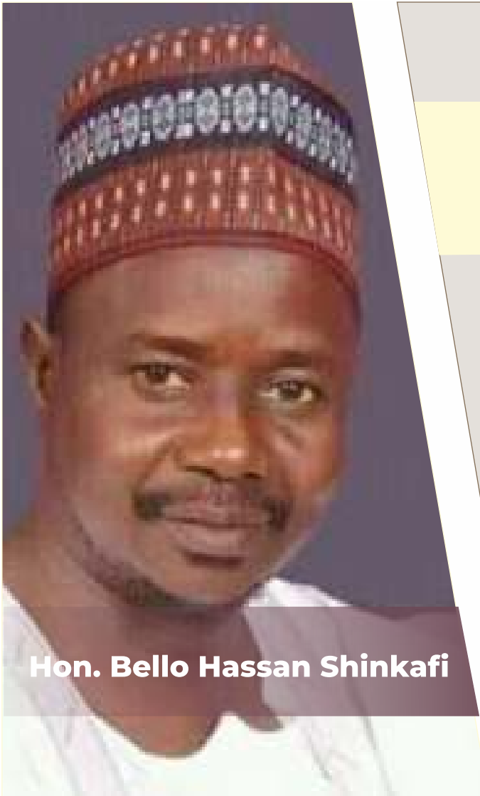
Hon. Bello Hassan Shinkafi