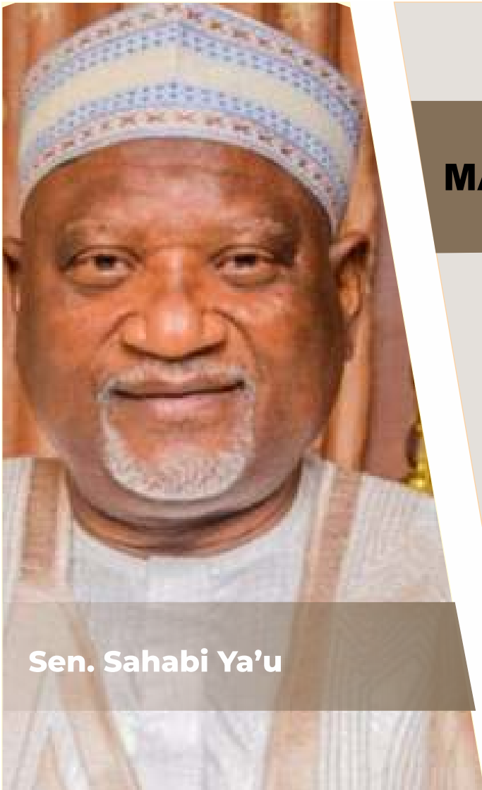
Sen. Sahabi Ya'u