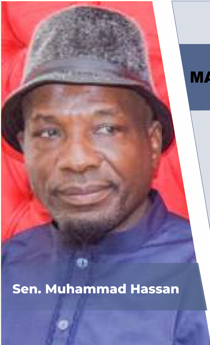
Sen. Muhammad Hassan