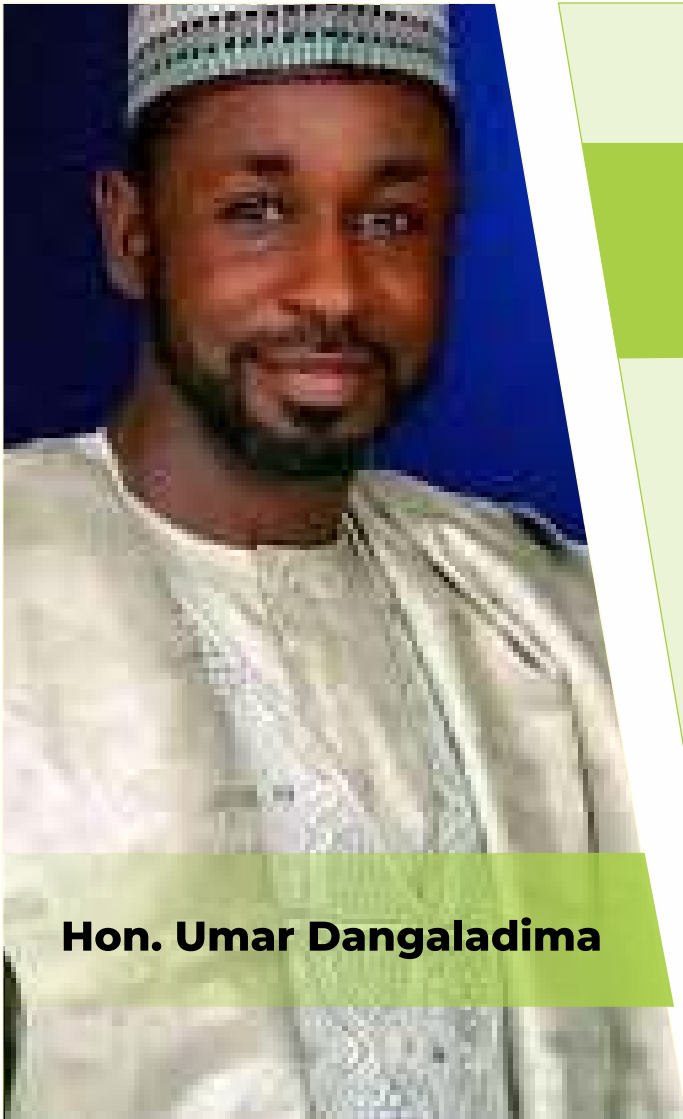
Hon. Umar Dangaladima