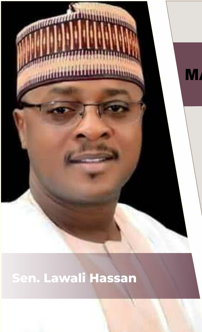
Sen. Lawali Hassan