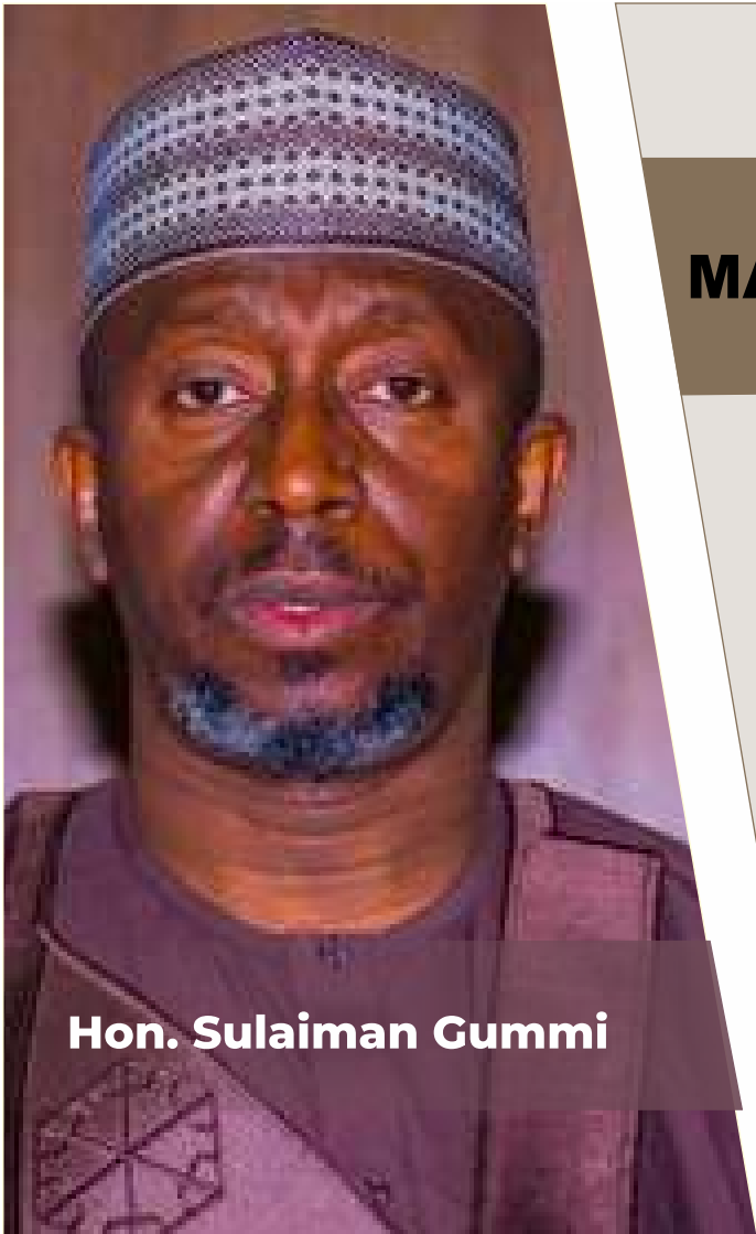
Hon. Sulaiman Gummi